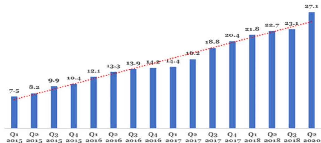
Fig. 2. Unemployment rates (2014-2020)

With an estimated 90 million persons (almost half the population) living below the extreme-poverty line, Nigeria has more poor people than any other country. 49 By 2030, the percentage of Nigeria's population living in extreme poverty is projected to increase further, from 44.2% to 45.5%. 50 Currently, unemployment stands at 27.1%, 51 which means that about 21.7 million young Nigerians are willing to work but unable to find a job.